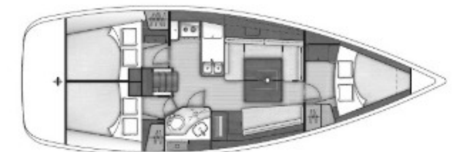
OCEANIS 37 INSIDE LAYOUT